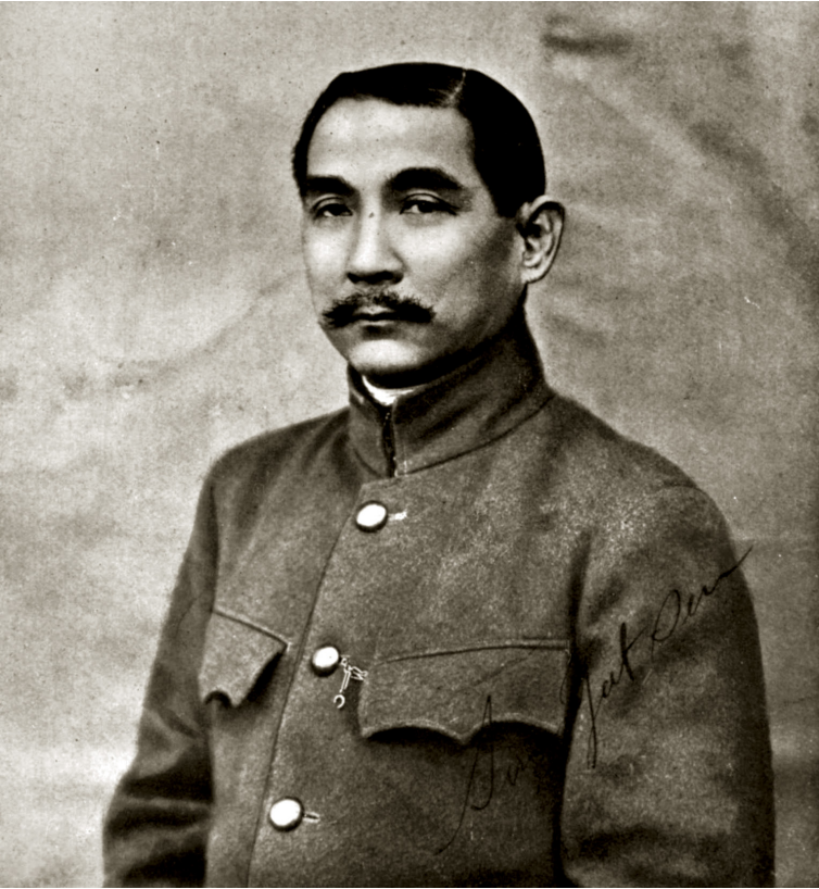
Figure 1 Sun Yat-sen's portrait as Provisional President of the Republic of China.

the association of Western dress with modernity and presented a visual contrast with the traditional robes of Manchu officials, but exchanged the military uniform of a revolutionary for the civilian attire of an established political leader. The other occasions on which Sun was photographed dressed in uniform, as for the official portrait, were in December 1911 on his journey from Shanghai to Nanjing to be nominated President, accompanied by Hu Hanmin, and during his participation in the visit of civil and military officials to the Ming imperial tomb in Nanjing on 16 February 1912. On the second occasion, he had already stepped down from the role of Provisional President of the Republic of China. In fact, six weeks after his provisional nomination, on 12 February, the Qing government abdicated and formally recognised the Republic, upon which, to avoid bloodshed, Sun Yat-sen resigned his position in favour of Yuan Shikai, who was trusted by both revolutionaries and the monarchy, having acted as a liaison between them.