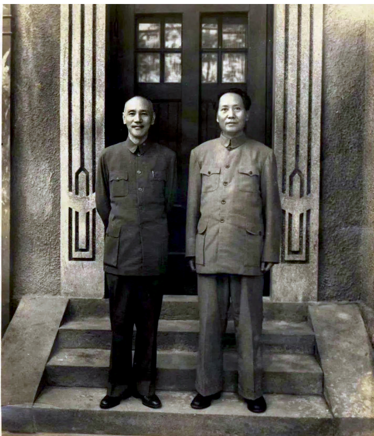
Figure 3 Chiang Kaishek (left) and Mao Zedong (right) wearing the Sun Yat-sen suit in Chongqing, 1945.

Sun's suit is a symbolic sign, because according to Peirce's scheme, its relation to Sun Yat-sen is an arbitrary convention based on the Chinese agreeing on the association of the Sun's suit design with Sun's doctrine, Nationalist ideology, and government structure. In Saussure's terms, Sun's suit – the expressive form – is associated with the meaningful content embodied by the revolutionary cause and ideology: the three buttons on the sleeve cuff representing the Three Principles of the People; the four pockets representing the four political and civil rights of the people (i.e. the power of election, the power of recall, the power of initiative, and the power of referendum) which aimed to balance power between the people and the government; and the five front buttons standing for the five branch-