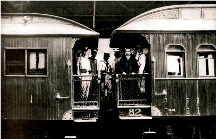
Figure 2 Sun Yat-sen as Director-General of the National Railways, 1912.

Sun's second photograph portrays him on board of a train in Tianjin in August 1912, the month that he was appointed Director General of the National Railways [fig. 2].