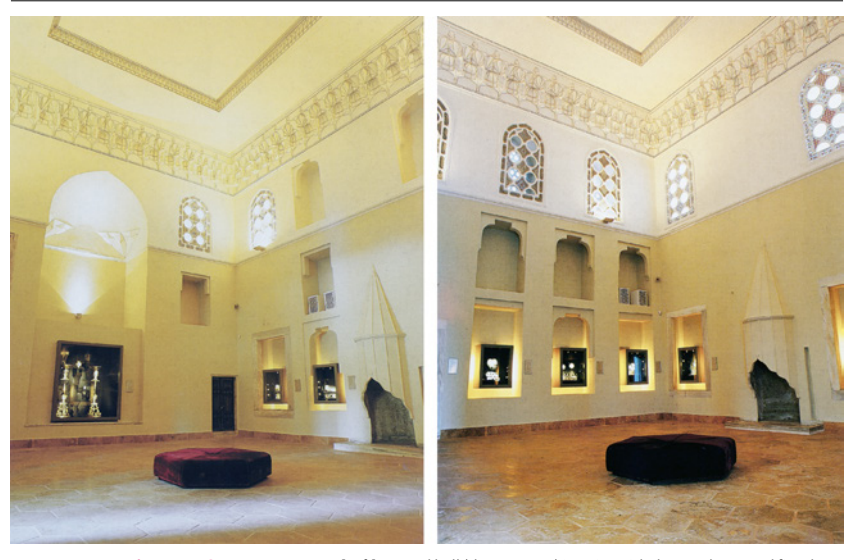
Figures 2a-b Inner Treasury. [Left] Second hall (throne room) interior with throne alcove and fireplace. [Right] First hall interior with multi-tiered niches and fireplace. (Reproduced from Necipoğlu, "The Spatial Organization of Knowledge", 6)

two volumes by a number of leading contemporary academics with invaluable contextualizations, who commented on each genre based on the scholarship of the day. Observing that the collection encompassed non-Islamic philosophical and scientific works alongside others reminiscent of pre-Islamic universalism, Cemal Kafadar has underscored Mehmed II's universalist and cosmopolitan ambitions in the same line with the competitive post-Timurid scholarly traditions.<sup>104</sup>