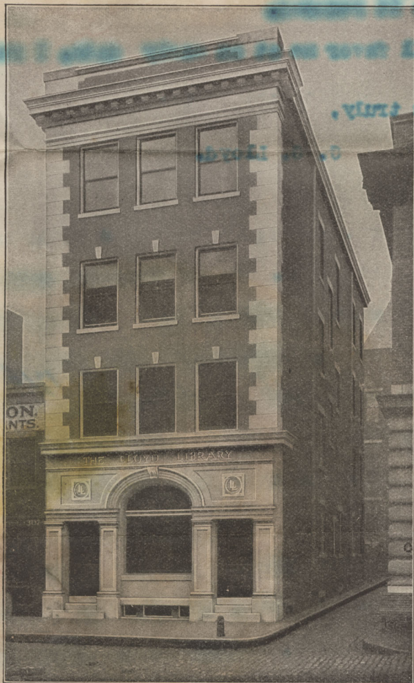
THE LLOYD LIBRARY—Erected in 1908