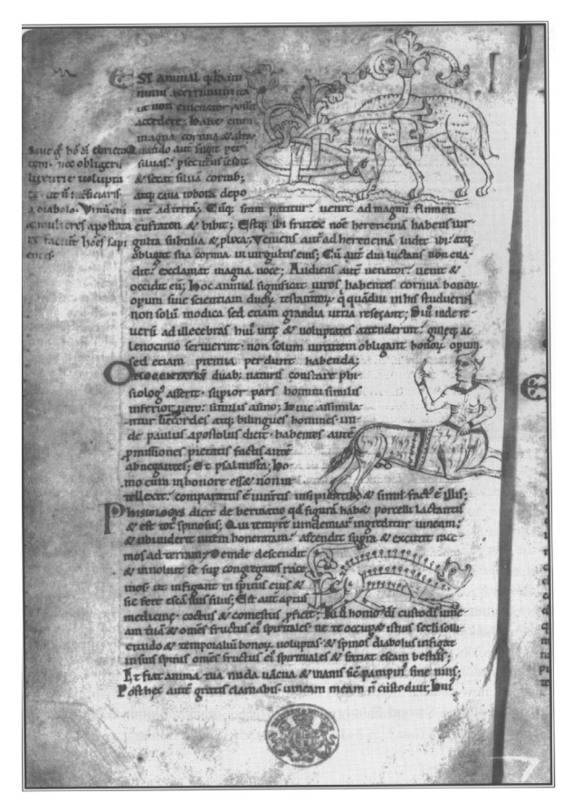
Table 5. London, British Library, MS Stowe 1067, f. 1<sup>v</sup>