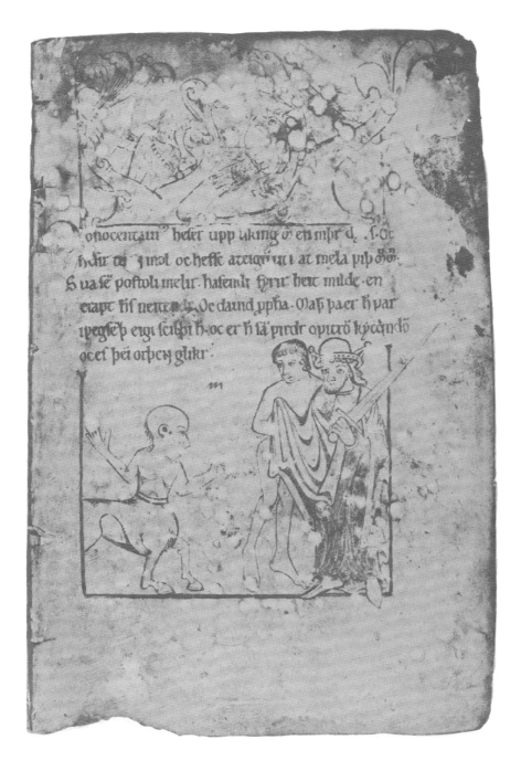
Table 1. Reykjavík, Árni Magnússon Institute, MS AM 673 a II 4°, f 4<sup>r</sup>