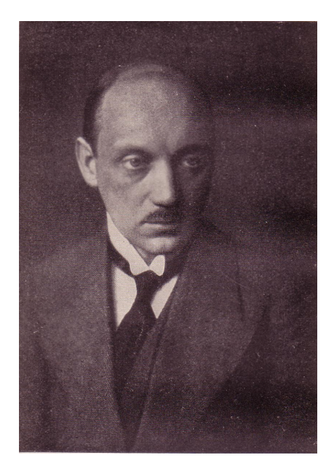
Table 3. Georg Kaiser