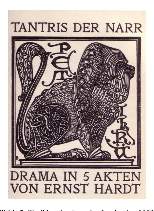
Table 2. Titelblatt der Ausgabe. Inselverlag 1909