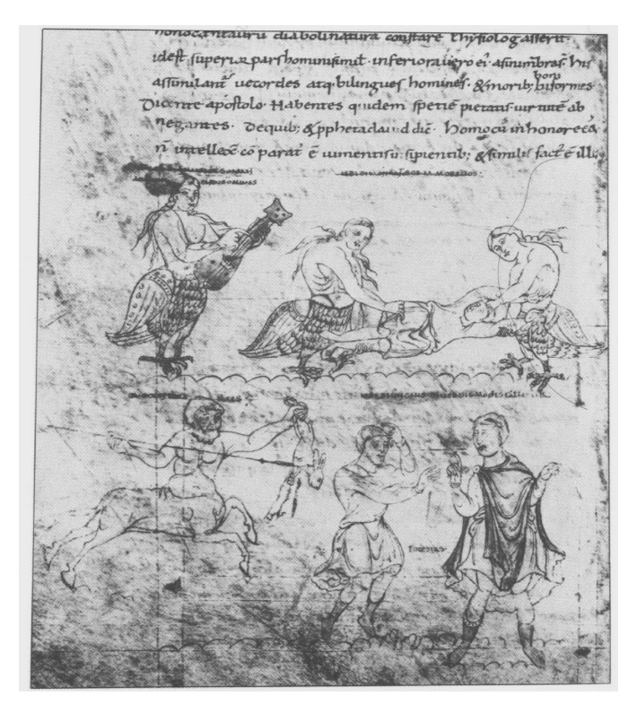
Table 3. Brussels, Bibliothèque Royale, MS 10066-77 f. 146<sup>v</sup>