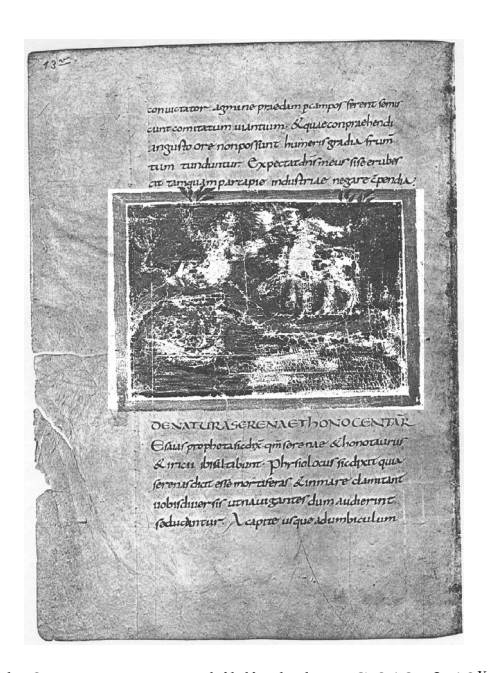
Table 2. Berne, Burgerbibliothek, MS 318, f. 13<sup>v</sup>