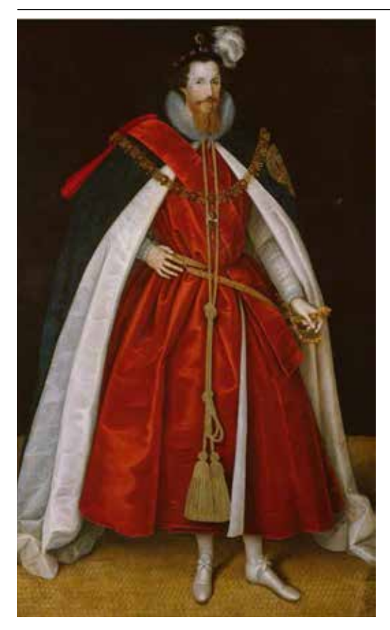
Figure 2. Marcus Gheeraerts the Younge, Robert Devereux , Montacute House, Long Gallery (c. 1597); NPG 4985

Queene ) is shown in the colours of the setting sun: the blue mantle of the Order of the Garter over a silk gown in the radiant Devereux-orange-tawny (Figure 2).<sup>26</sup>