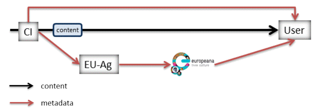
Figure 3 - Content and metadata value chains in the Europeana model

Europeana operates in this short value chain aggregating metadata<sup>68</sup>. So we have two value chains: one, extremely short, for content; the other, more complex, for metadata (see Figure 3):